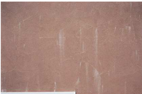
Photo 1: Cracks that are dispersed across a large area can be repaired with elastomeric coating if narrow in width (1/32" or less), Procedure A, or with glass fiber reinforcing mesh and acrylic base coat, Procedure B. Surface cleaning to remove the efflorescence and any other surface contamination must be done first.