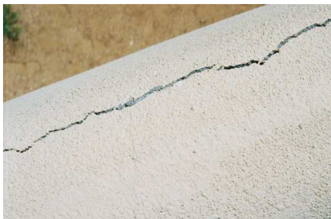
Photo 1: the large crack in the parapet requires elastomeric crack filler, followed by waterproofing with glass fiber mesh installed around the parapet and a minimum of 6" down each side.