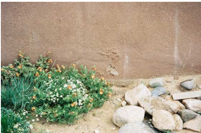
Photo 1: The blistered area at the base of this wall can be removed with a hand tool, and new color/texture matched finish applied to repair it. The likely root cause of this blister is ground water that seeps into the stem wall below and wicks up into the stucco. A canale (scupper) from the roof above drains water directly into the ground and not away from the wall. A diverter that directs water away from the wall would prevent recurrence.