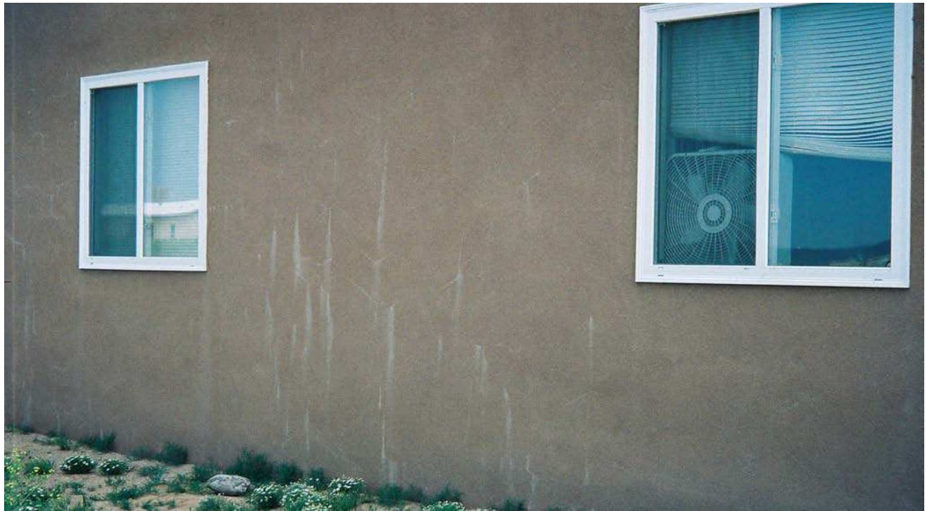
Photo 1: Efflorescence can be cleaned with a mild acid solution to remove unsightly stains on the exterior surface of the stucco.

Efflorescence can generally be removed by light washing with a cleaning agent. A common household solution is vinegar and warm water. Proprietary cleansers 1 are also available from a number of different sources (see notes below). Care should be taken to avoid heavy abrasion of the surface which could damage the integrity of the textured material. A soft bristle scrub brush should be used to scrub the affected area with the cleaning solution. Always try a small inconspicuous area first to be sure of desired results. When using proprietary cleansers follow the instructions and safety precautions on the packaging.